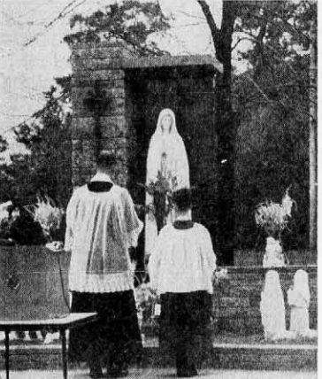
NEW FATIMA SHRINE—A permanent shrine to Our Lady of Fatima on the grounds of Council 3228, Knights of Columbus, 1313 South Post Road, Indianapolis, was dedicated recently.

ness. America to millions of Russians means plagues that crash, rockets that explode, murder, rape, extortion, kidnaping, strikes, violence, and immorality.