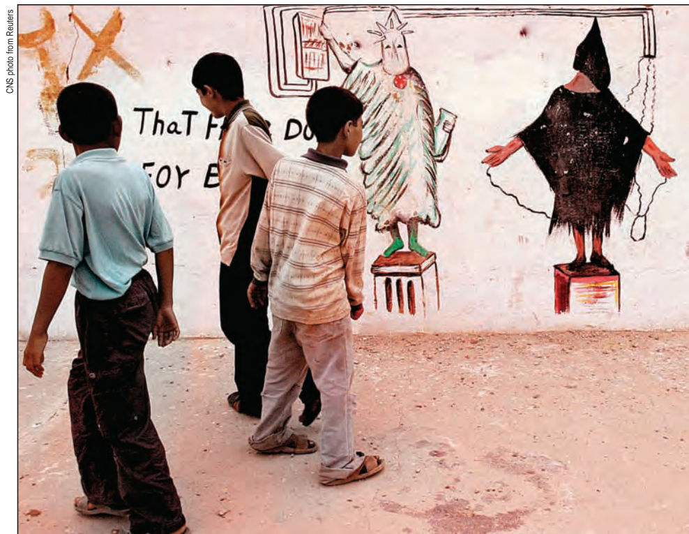
Iraqi boys look at graffiti depicting the U.S. Statue of Liberty sending electric current to a masked prisoner. While a debate continues about who is responsible for the abuse of prisoners at Abu Ghraib in Iraq, only the soldiers facing court-martial have been held accountable. This raises questions about the difference between responsibility and accountability.

Elected officials are accountable to their constituents for the votes they cast. Manufacturers are accountable to the public for safe products and protection of the environment. Ministers are accountable to their congregations for the service they provide.