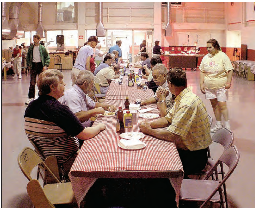
People enjoy a pancake breakfast at the Terre Haute Catholic Charities Food Bank during Hunger Awareness Day in June 2004. The work of Terre Haute Catholic Charities is part of the work of evangelization in the Church.

The area they minister to has "got every ill you can think of—and we're