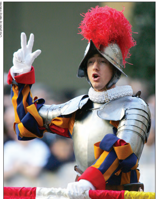
A Swiss Guard recruit holds the flag of the Guard and raises three fingers—a symbol of the Trinity—as he takes his oath during a swearing-in ceremony on May 6 at the Vatican. Founded in 1506, the corps consists of 110 young Catholic male volunteers who swear to protect the pope, even at the cost of their own lives.