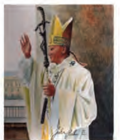
Call for your Beautiful Memorial Woven Tapestry!

We accept: Visa/MC/AMEX or personal check