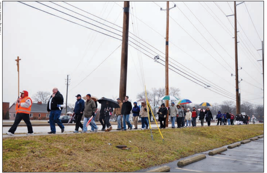
Pro-life advocates process and pray from the Movie Buff Theater at 86th Street and Michigan Road to the Planned Parenthood facility at 86th Street and Georgetown Road in Indianapolis to launch the 40 Days for Life spring campaign on Feb. 10.