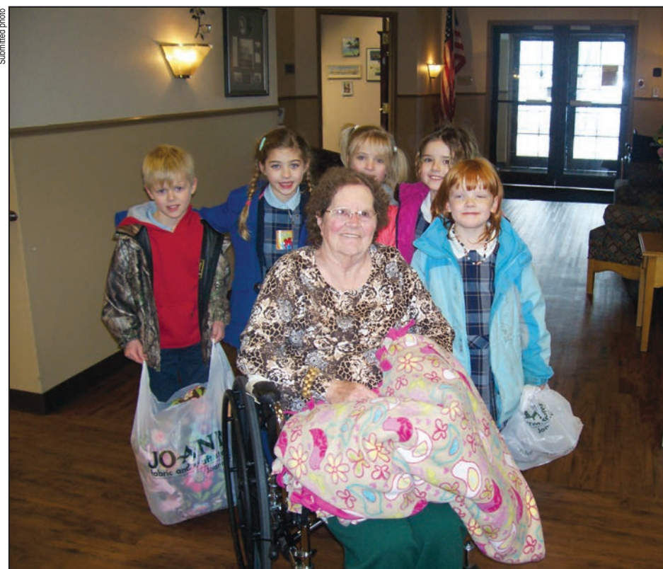
During Catholic Schools week in January, first-graders at St. Louis School in Batesville made blankets for the residents of The Waters of Batesville nursing home. First graders pose with a resident who received one of the blankets.