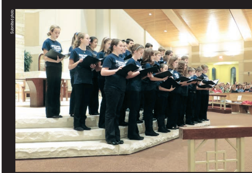
Members of the New Albany Deanery Honor Choir perform before the New Albany Deanery's welcome Mass for Archbishop Joseph W. Tobin on Jan. 29.

"It opens the dialogue between the deanery schools and teachers," Rebilas