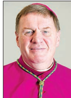
Archbishop Joseph W. Tobin

The use of the pallium, which dates to the fifth century, is reserved for territorial archbishops and the pope. A pallium is an approximately two-inch wide, circular, woolen band worn around the neck, chest and shoulders. It bears six black crosses and