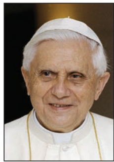
Pope Benedict XVI

ROME (CNS)—The halls of history might hold some clues as to what kind of impact Pope Benedict XVI's resignation will have on the Church, and how to navigate a smooth transition, said a U.S. scholar.