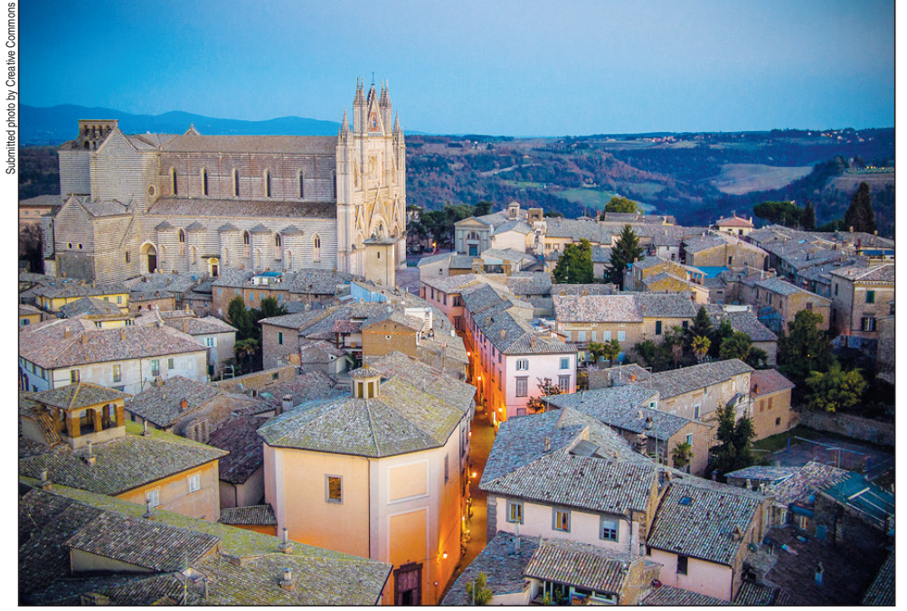
This photo captures the Cathedral of Orvieto and part of the old city of Orvieto. The cathedral was built in the 13th century.

(For more information, contact Carolyn Noone at 317-236-1428 or 800-382-9836 ext. 1428, or by e-mail at cnoone@archindy.org .) †