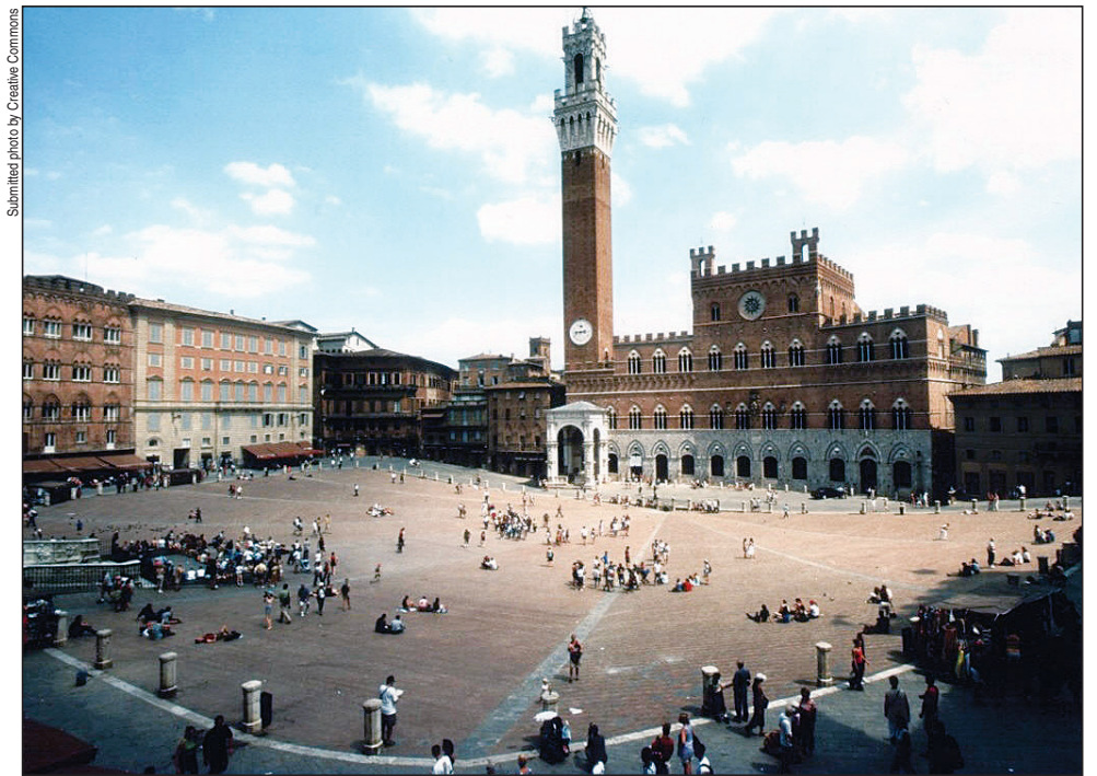
Mangia Tower, built in the 14th century, overlooks Piazza del Campo, the main square in Siena, Italy.