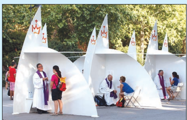
Priests hear confessions in Parque del Retiro during World Youth Day in Madrid on Aug. 17, 2011. Pilgrims could take advantage of the 200 temporary open-air confessionals constructed in Madrid’s equivalent to Central Park.

“Have mercy on me, God, in accord with your merciful love; in your abundant compassion blot out my transgressions. Thoroughly wash away my guilt; and from my sin cleanse me. For I know my transgressions;