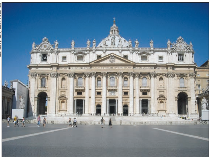
Pilgrims will witness Archbishop Joseph W. Tobin receive his pallium on June 29 at St. Peter's Basilica in Rome, Italy.