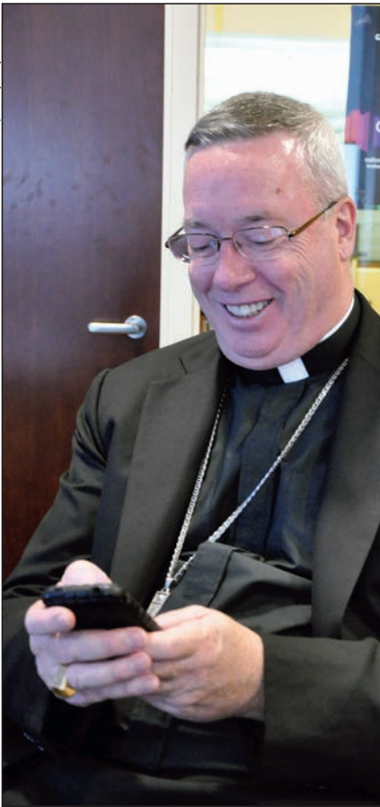
Auxiliary Bishop Christopher J. Coyne smiles as he types a Twitter message on his cell phone during a break between speakers at a National Catholic Youth Conference press conference for local media on Oct. 19, 2011, at the Indiana Convention Center in Indianapolis.